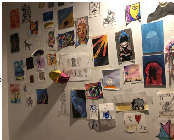
(above & below) artwork from the 2SLGBTQIA+ youth group

Trans Connect runs a weekly drop in group for 2S LGBTQIA+ youth aged 12-18 in partnership with the Nelson and District Youth Centre. We saw attendance grow to between 12-16 young people each week and in both school semesters a practicum student from the Kootenay Art Therapy institute joined us and co-facilitated a variety of art therapy based approaches to art activities and group work. Youth group activities included nail art, lino cut block printing, queer world building, makeup skills, button making, slime making, and facilitated discussions on relationships & health, local resources and queer/trans history.